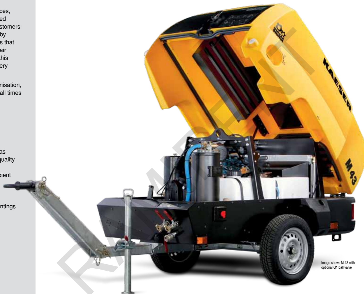
Image shows M 43 with optional G1 ball valve